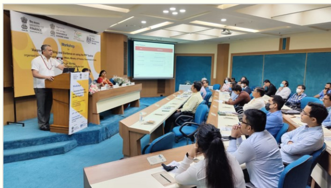
Shri Baldeo Purushartha, JS (ISD) delivering a session during the workshop on PPP Toolkits organized by DEA

Organized in collaboration with Foreign, Commonwealth and Development Office (FCDO), UK, the workshop aimed at sensitizing and training government officials in using PPP toolkits for decision making in PPP projects. It broadly covered introduction and walkthrough of PPP structuring Toolkit, Value-for Money Toolkit, Framework for recognition, valuation and reporting of contingent liabilities Toolkit, Post Award Contract Management (PACM) toolkit.