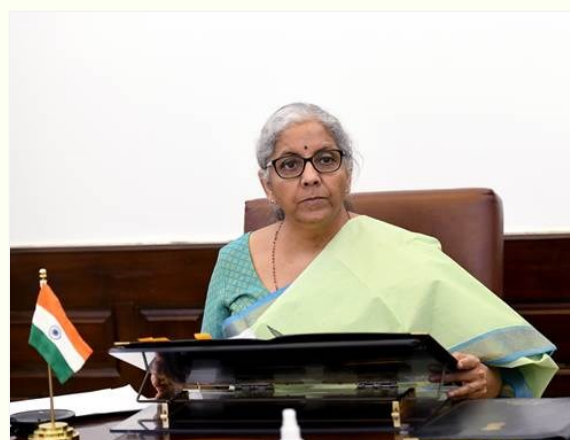
Smt. Nirmala Sitharaman chaired 7th Annual Meeting of Board of Governors of NDB

The 7 th Annual Meeting of the Board of Governors of New Development Bank (NDB) was chaired by the Union Minister of Finance & Corporate Affairs and India’s Governor for the NDB, Smt. Nirmala Sitharaman through video conferencing in New Delhi. The meeting was also attended by Governors/ Alternate Governors of Brazil, China, Russia, South Africa and the newly joined members Bangladesh and United Arab Emirates (UAE).